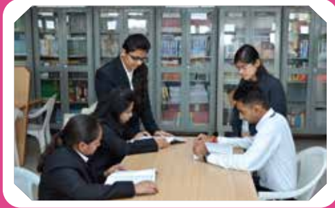
The Knowledge Hub