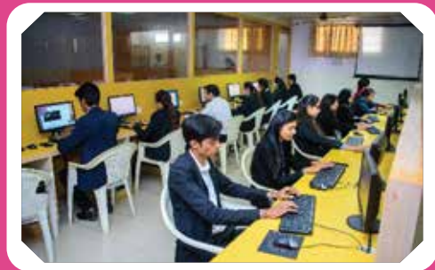
Hi-tech Computer Centre